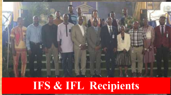
IFS & IFL Recipients