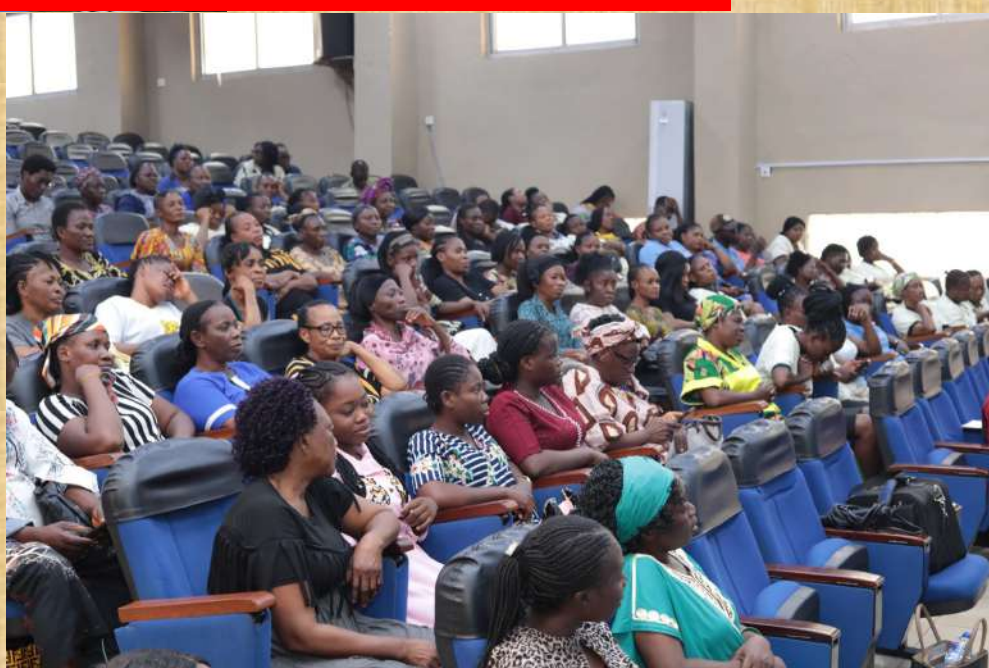
The participants listen keenly at the break-out session BBS Auditorium A