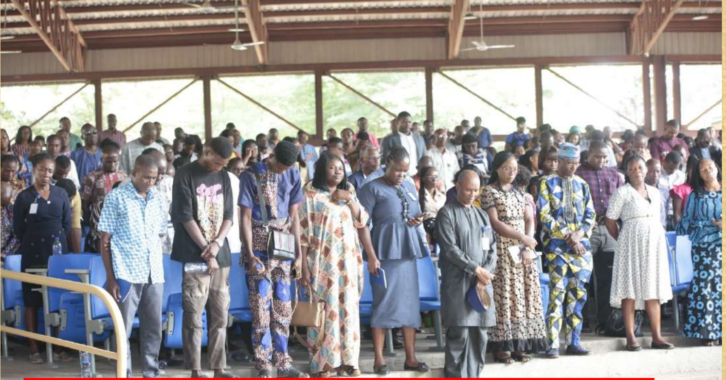
A cross-section of faculty and staff during the prayer session