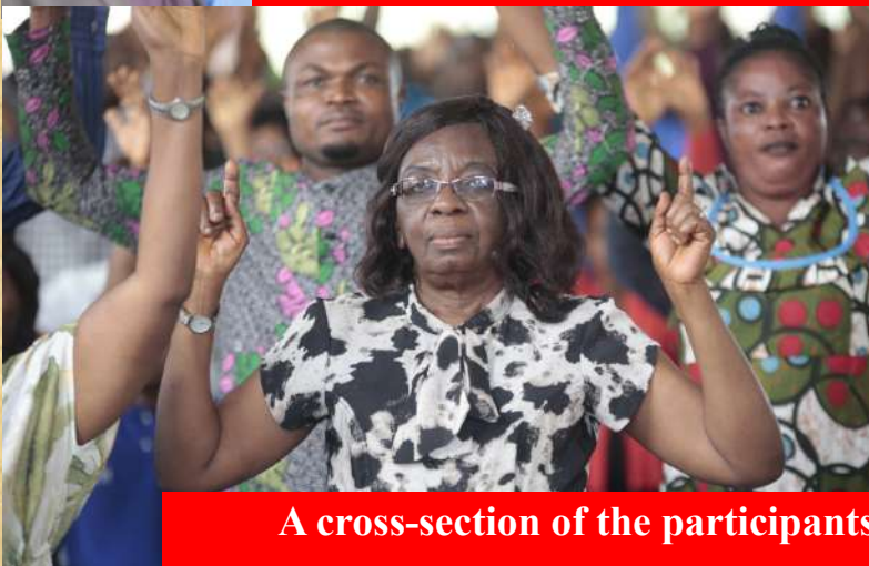
A cross-section of the participants during the stretch break