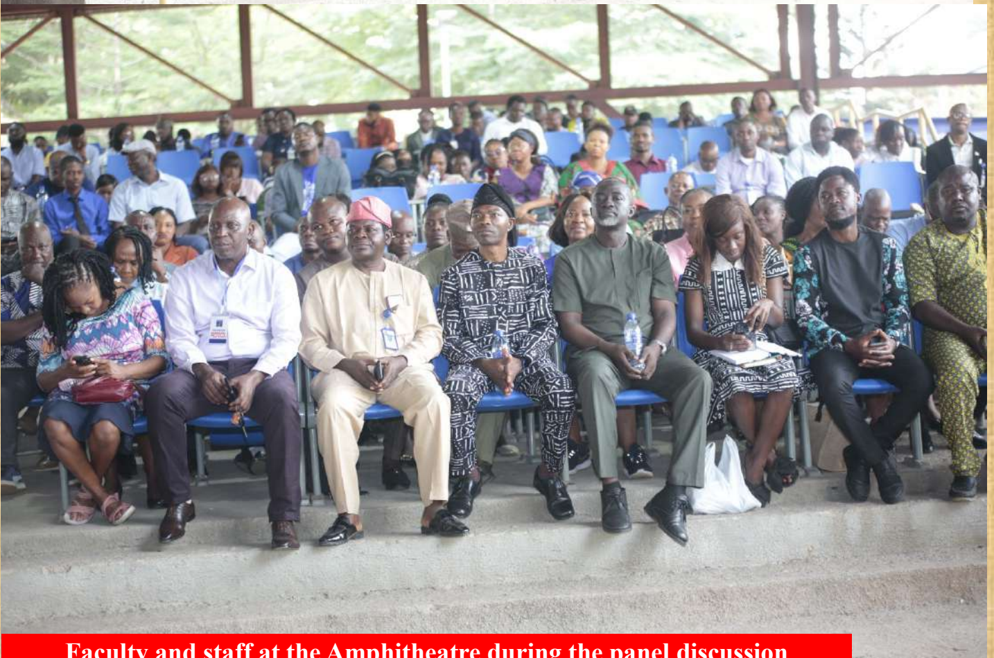
Faculty and staff at the Amphitheatre during the panel discussion