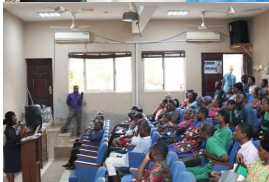
Snapshot from the Break-out session