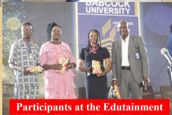
Participants at the Edutainment

A quiz and debate session brought an interactive element to the event, with staff and faculty competing to answer questions based on the presentations. Quick thinkers and attentive listeners walked away with exciting gifts and incentives, making learning both engaging and rewarding.