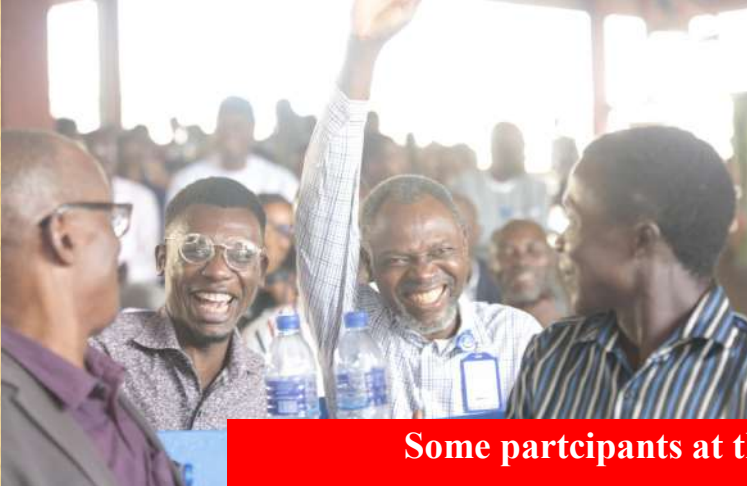
Some participants at the Amphitheatre