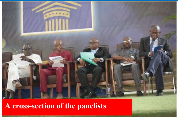
A cross-section of the panelists