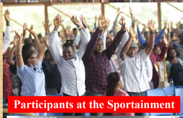
Participants at the Sportainment

The sub-committee on Social and Sports added a touch of fun to the event by organizing various short and engaging exercises, ensuring it wasn't all work alone.