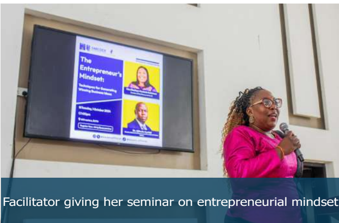
Facilitator giving her seminar on entrepreneurial mindset