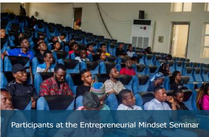
Participants at the Entrepreneurial Mindset Seminar