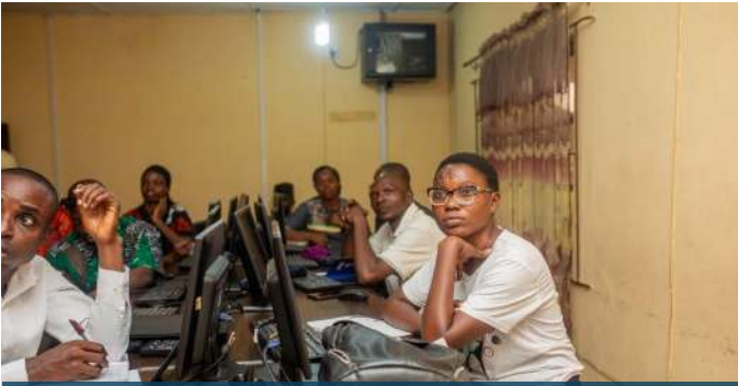
Participants of the Digital Growth Workshop