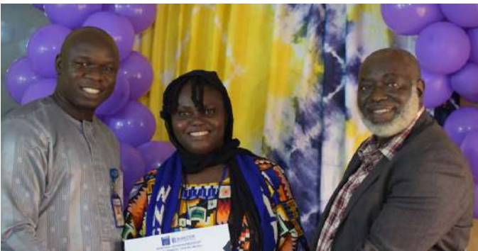
Participant receiving certificate of completion of training