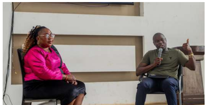
Q&A Session with facilitators of the Entrepreneurial Mindset Seminar