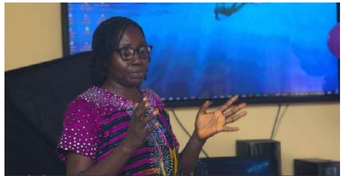
Participant giving testimonial on the impact of the Digital Growth Workshop on her business.