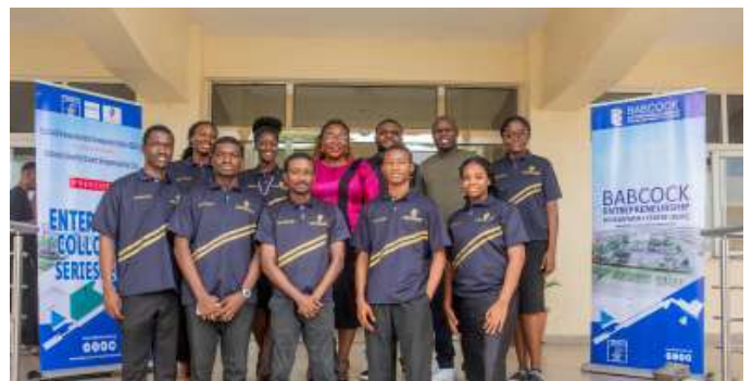
BUSEC Excos with Facilitators