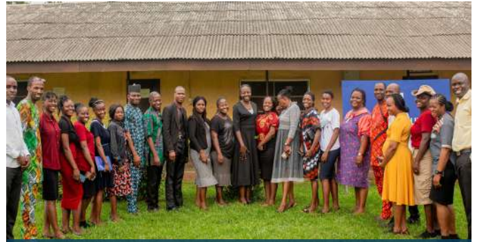
Participants of the Digital Growth Workshop