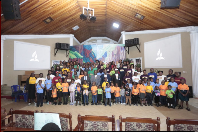
Vacation Bible School for the kids of the BU Community