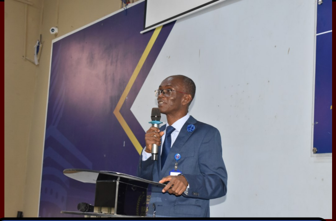
The Annual Colloquium for Faculty & Staff took place in August 2025.

The 15th Annual Chaplaincy Training for staff and students chaplain also took place in August 2025